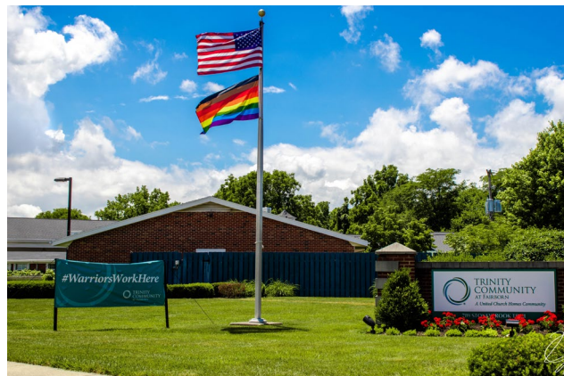
Pride flag flying outside the United Church Homes Trinity Community in Ohio.

To help improve access to LGBTQ+ welcoming long-term care communities, the Human Rights Campaign (HRC) Foundation and SAGE developed the Long-Term Care Equality Index (LEI) . The LEI sets the first national standards for inclusive LGBTQ+ policies and practices for senior housing and residential long-term care communities. The LEI team supports participating communities by providing a self-assessment process, a comprehensive LEI resource guide of best practices, and educational presentations.