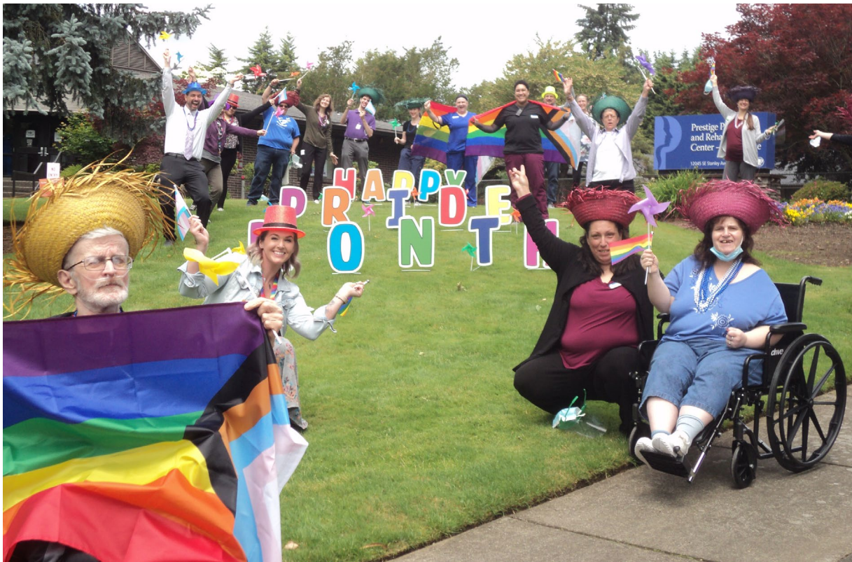
Residents and staff participate in Pride celebrations at Prestige Post-Acute and Rehabilitation Center – Milwaukie in Oregon.

HRC Foundation and SAGE believe that most long-term care housing providers want LGBTQ+ residents to feel comfortable and safe in their community. The LEI supports communities to assess, develop and put into place proactive policy and practice. We hope this guide empowers those seeking residential long-term care and senior housing to ask about LGBTQ+ foundational policies and practices. LGBTQ+ older adults and their loved ones deserve quality, informed, and respectful care.