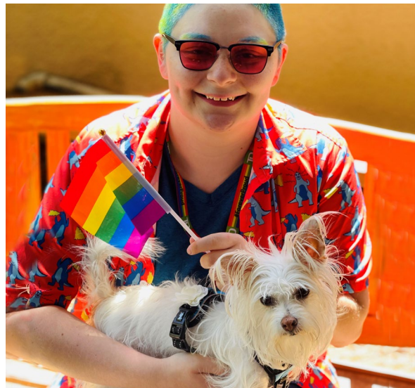
Staff Pride celebration at Chaparral House in California.

Why is this important? Training and diversity efforts are another thing that the LEI looks at to determine if a long-term care community is doing its best to support LGBTQ+ people. Training is necessary because research shows that when staff members are given training on LGBTQ+ older adults, they are more accepting of LGBTQ+ identities and better prepared to provide care. Diversity efforts for the inclusion of LGBTQ+ identities directed toward both staff and residents are also important. This is because diversity efforts represent that the whole community is committed to recognizing and welcoming LGBTQ+ people.