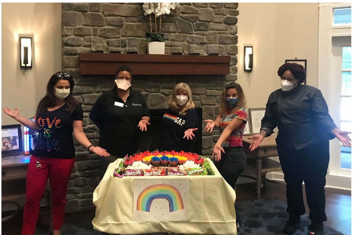
Pride celebration at Blue Bell Place, a Watermark community in Pennsylvania.

We deserve to feel safe and have our needs met when seeking care. A long-term care community's dedication to LGBTQ+ inclusivity must be rooted in inclusive policies and practices. Policies and practices that are inclusive of LGBTQ+ older adults shape an organization's culture and expectations. Here are some important questions you might have about your personal choices and rights in long-term care, along with policies and practices that address those concerns.